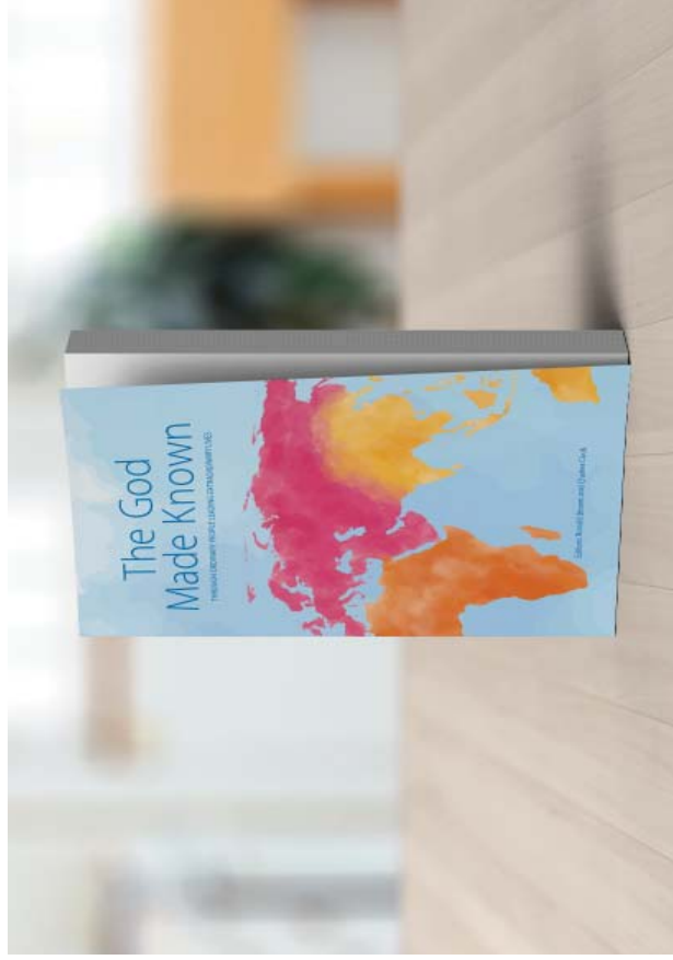
The God Made Known

See Appendix "D" for some ideas for teaching and preaching on God's mission in the world. Visit cmacan.org/mobilizers