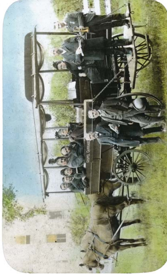
A. B. Simpson and the Gospel Carriage

This booklet will help get you started and the resources listed are just a few initial first steps. If you come up with other ideas, go for it! And while you’re at it, share them with us and those around you.