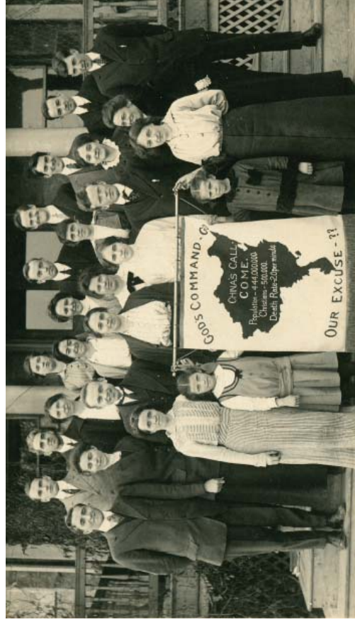
Prayer Meeting for China Missions – circa 1915

Want more ideas or more information of how to develop a mission-focused life, visit cmacan.org/mobilizers