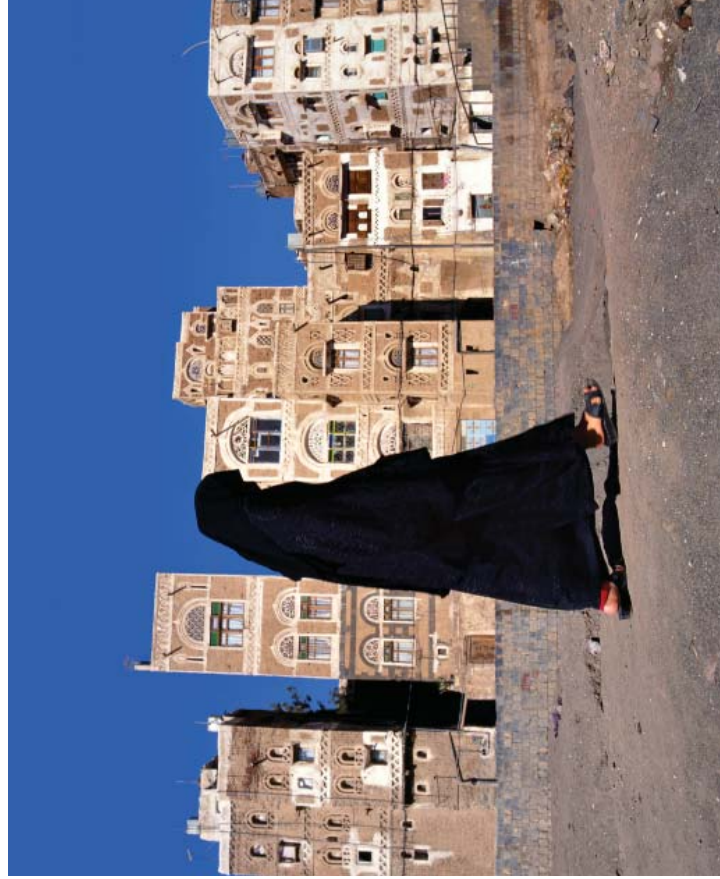
Learn more about LRPG's at cmacan.org/LRPG

Mission committees mobilize the church when they: